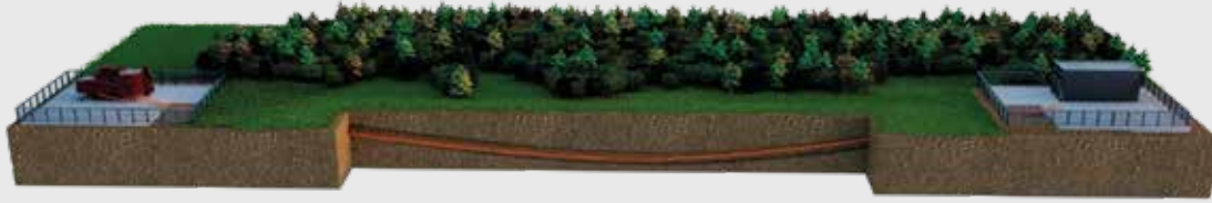
Illustration of trenchless crossing