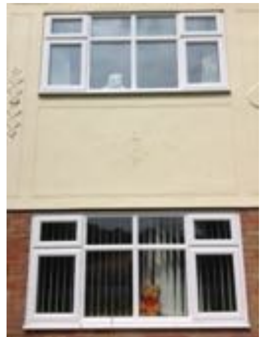
Teddies in the windows